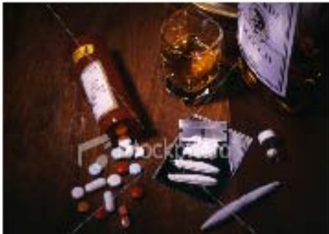
drink or drug abuse